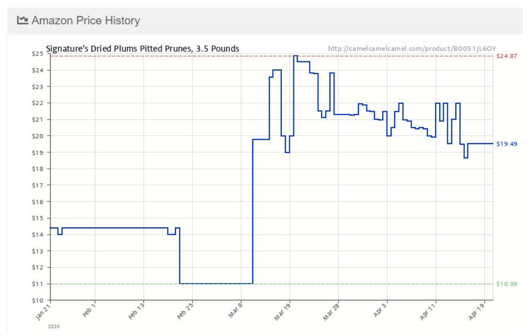
57. Additional presumptively unlawful price increases on third-party supplied Amazon sales include, but are not limited to, the following:

• Signature's Dried Plums Pitted Prunes, 3.5 lbs: Increases up to 159 percent, from $10.99 to $24.87, following declared states of emergency. 97