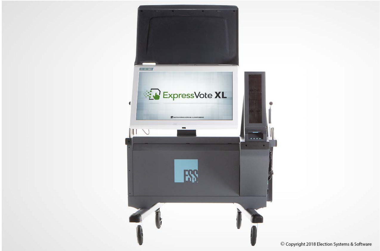
Fig. 1 ExpressVoteXL (Px 1012.)

The machine is reliable and easy to use. It is a hybrid device, combining ballot-marking and tabulating/scanning functionalities within a single system. (2/18/20 Tr. 105:1–6; 2/19/20 Tr. 186:22–187:6.) The voter first inserts a blank card into the slot to the right of the screen; this prompts the XL to load the appropriate ballot, which appears on the 32-inch touchscreen. (2/19/20 Tr. 186:25–187:6.) After she makes her selections, the machine prints them, producing a summary card: