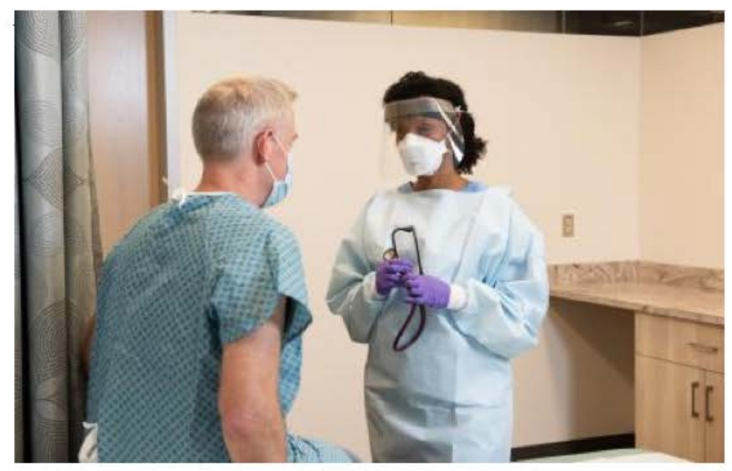
April 01, 2020