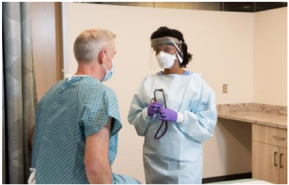
April 01, 2020