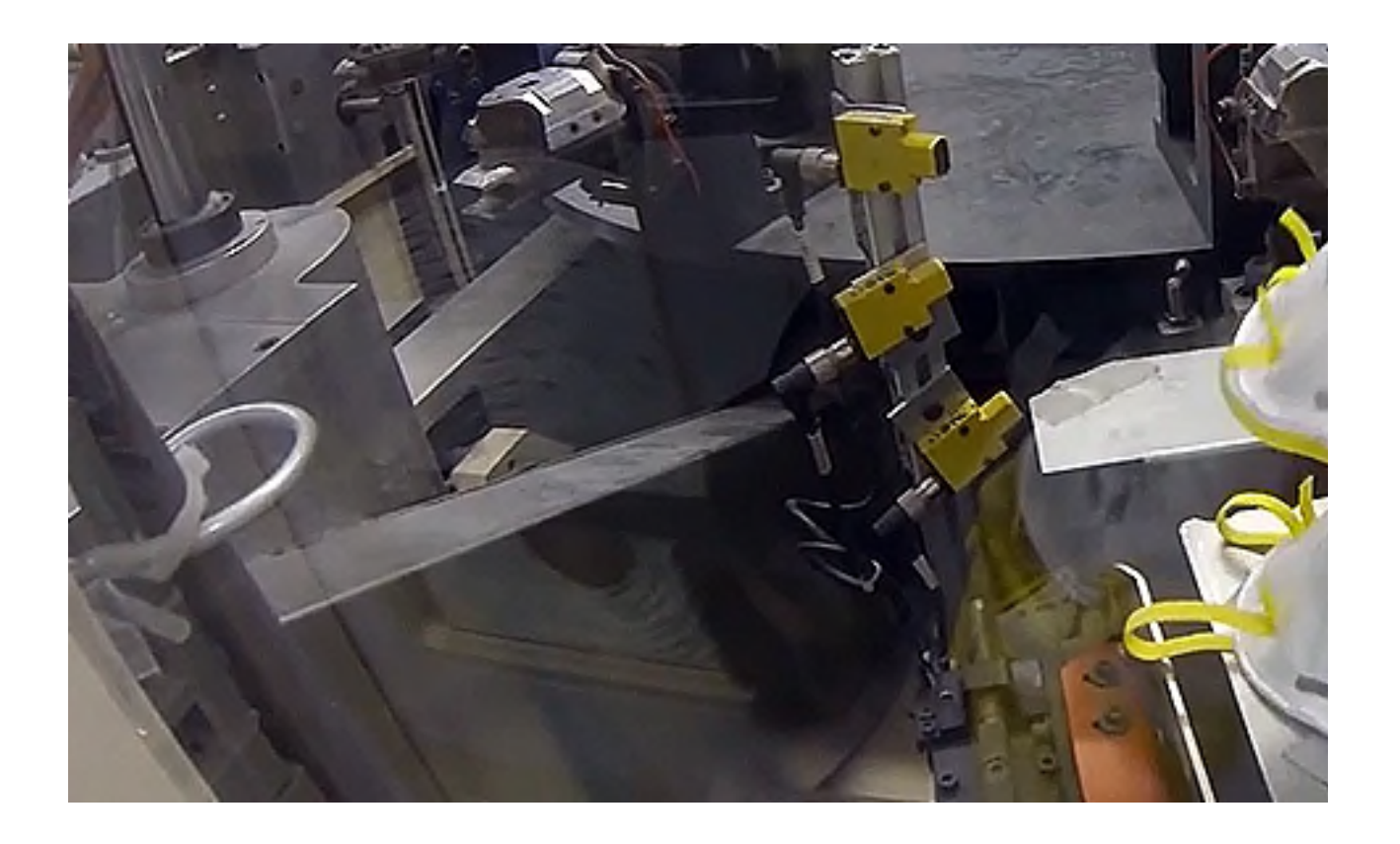
3M COVID-19 Anti-Fraud, Anti-Price Gouging, and Anti-Cou