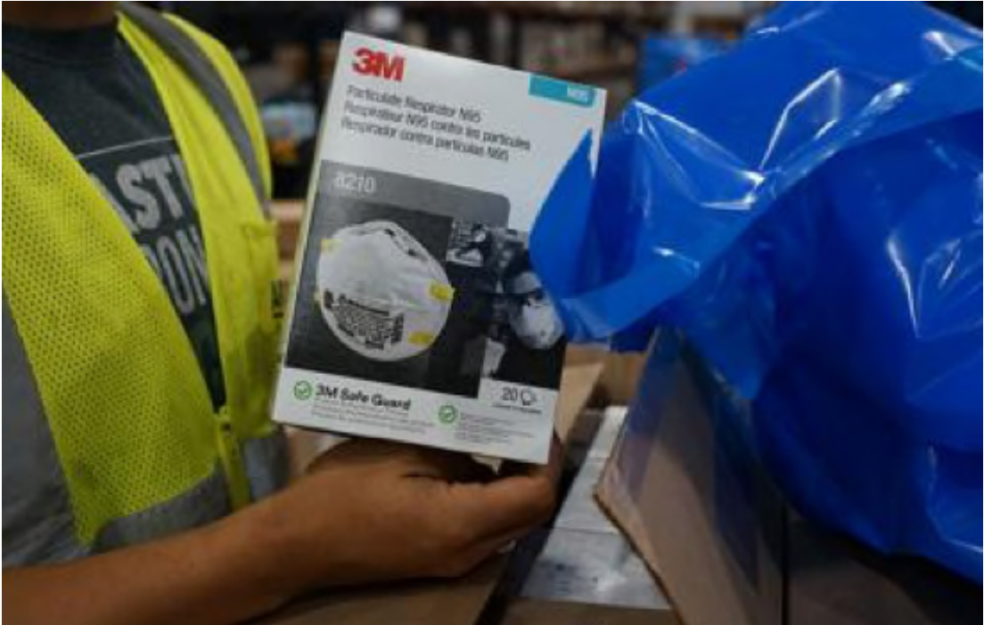
March 31, 2020

3M introduces hotline, releases price lists to help combat counterfeits, price gouging during COVID-19